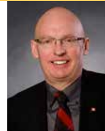
Mayor Gerry Thiessen