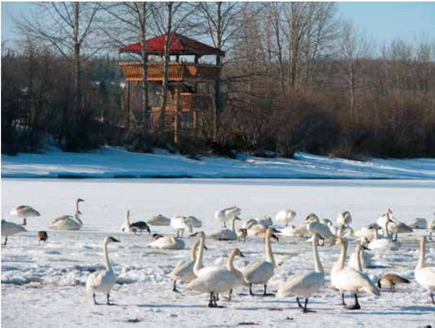
Congratulations to Ethan Janzen for this great photograph that truly depicts what we love about spring in Vanderhoof. Ethan won the People's Choice Best Photo during the District of Vanderhoof Photo Contest. Voting for the People's Choice photo was done on the District of Vanderhoof Facebook page. Go there to view all the other fantastic photos that were submitted in October. Stay tuned for future photo contests hosted by the District of Vanderhoof.