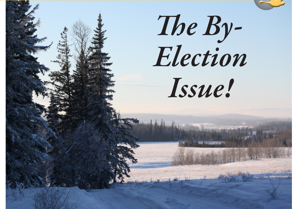
A beautiful view of the Nechako Valley.