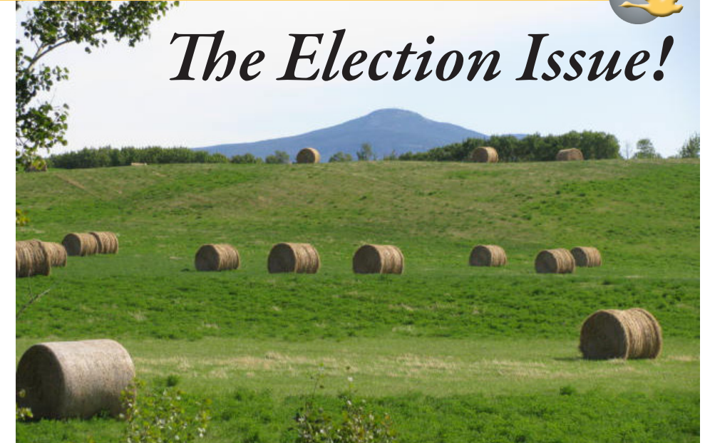
A beautiful view of Sinkut Mountain through a field of haybales during the harvest in Vanderhoof.