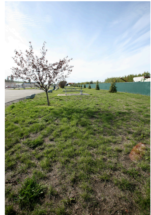
Highway 16 Park, the newest planted green space in Vanderhoof.