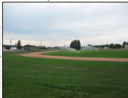
Sports Park is progressing on schedule

The Vanderhoof Bears won the north-west zones to advance to the Provincials held in Houston. At the Provincials Vanderhoof went 5-1 in the round robin and won 6-1 over Surrey in the final to finish the year as B.C. Midget Tier 4 Champions.