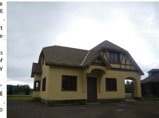
The Museum's newest addition the Smithers House is finished and ready for visitors

Every Thursday from 12:00 noon until 5:00pm at Riverside Park - Local produce and products