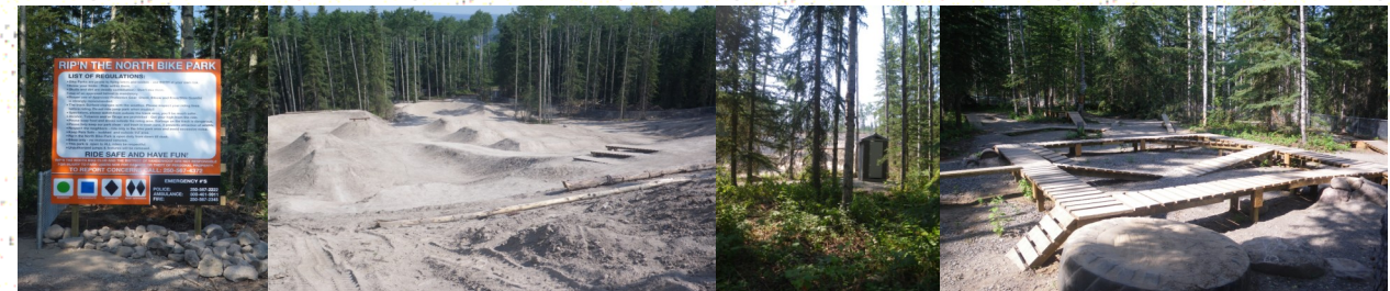
Rip'n the North Bike Park located at the west end of 7th Street.

If you miss us there, you are welcome to attend the next regular council meeting on September 9 th @ 5:00 PM in the District Office Council Chambers.